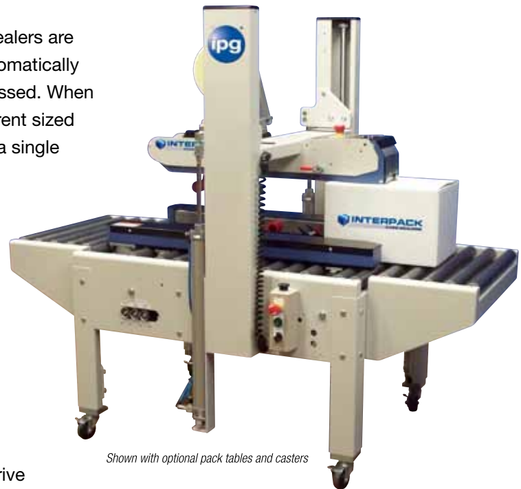
Shown with optional pack tables and casters

When you compare features, benefits and value, Interpack Case Sealers are the right choice for operators, plant engineers, maintenance and purchasing.