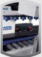
Random top squeezers