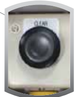
"Clear" button for jams & replacing bottom tape roll