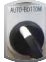
Top & bottom or bottom only seal operation modes