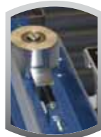
Self-tensioning & tracking side drives simplify belt replacement