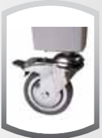
Heavy duty casters