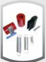
Spare parts kits