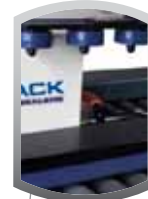
Optional top squeezers compress top major flaps