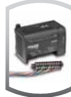
Digital pneumatics to improve throughput speed