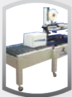
Infeed & exit tables