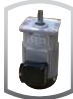
1/3 hp motors for heavy duty usage